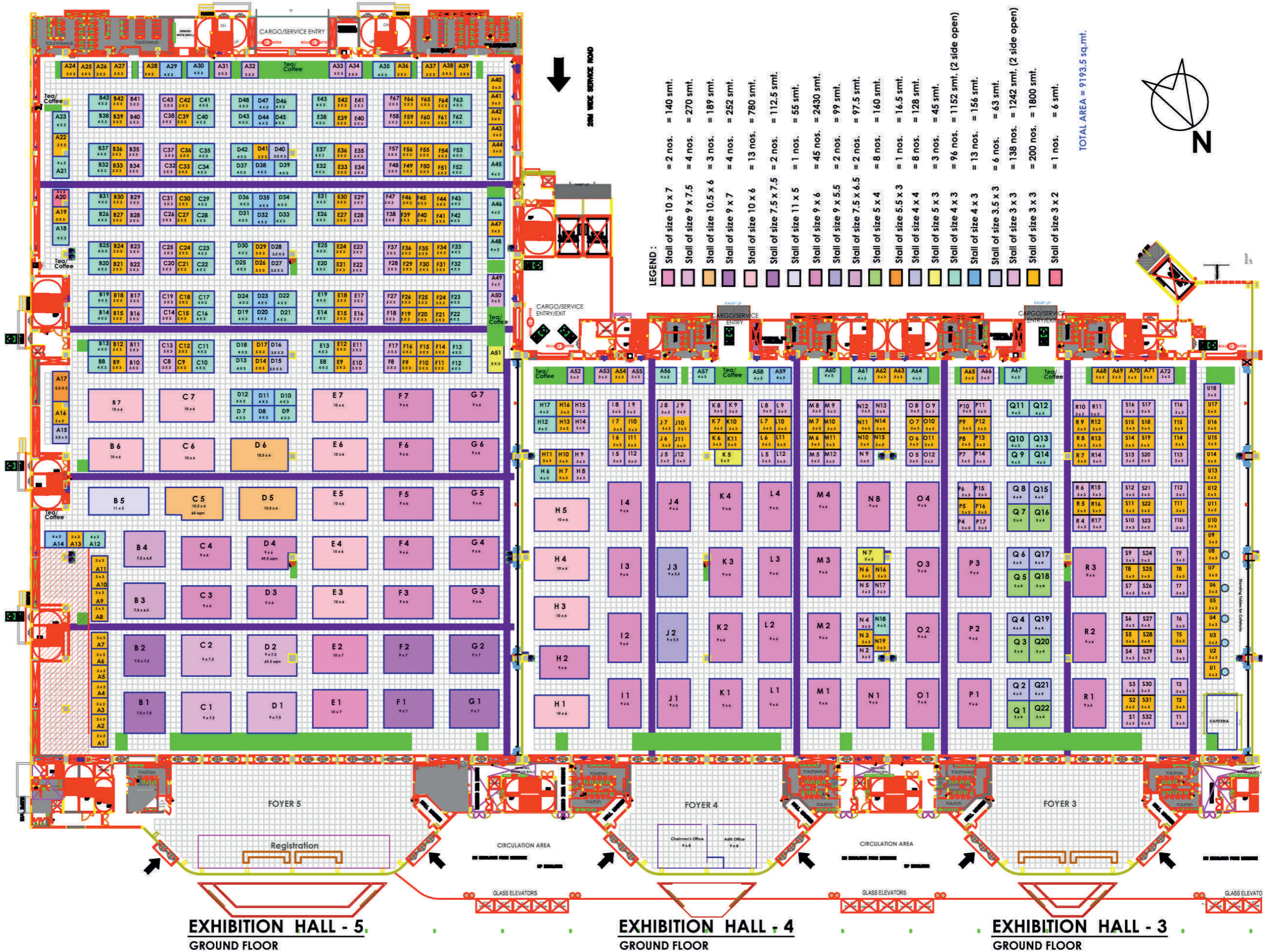
PROPOSED LAYOUT PLAN FOR EXPONENT INTERNATIONAL INDIA 2024, PRAGATI MAIDAN, DELHI